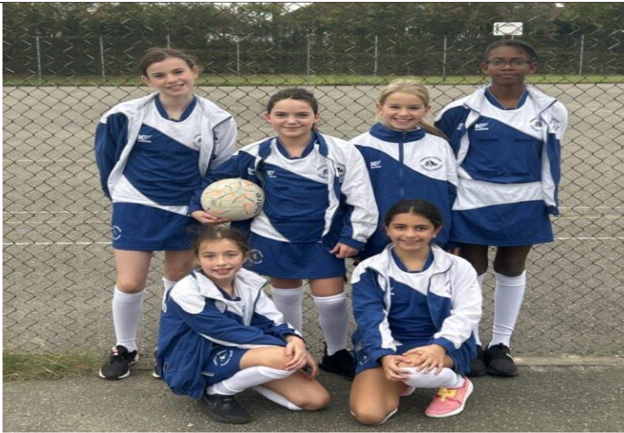
Above photo: The girls high 5 netball team.