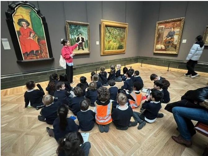
Above phot: Year 2 listening to a tour guide about the paintings in the hall.