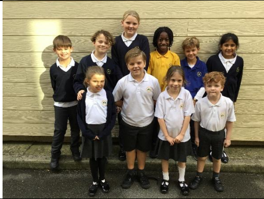
Above: Picture of School Council 2025-2026